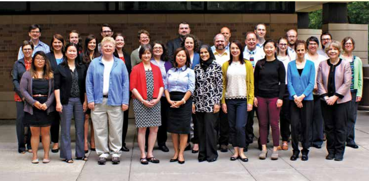
2017 Public Health Law Center Staff

In 2016, the Public Health Law Center staff published six scholarly articles and made 139 presentations around the country. Visit www.publichealthlawcenter.org to view featured resources—use the drop-down menus to find publications on a variety of topics.