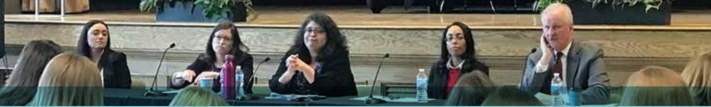
Panelists for the Menu Labeling event answering questions from our live and virtual audience.