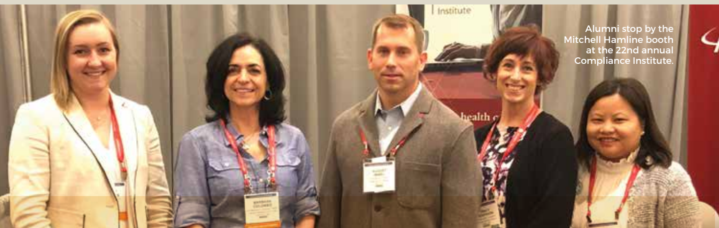
Alumni stop by the Mitchell Hamline booth at the 22nd annual Compliance Institute.

Mitchell Hamline is proud to be a member of the American Health Lawyers Association (AHLA) School Alliance. Our health law students are able to take advantage of special benefits such as attending AHLA conferences and participating in AHLA's mentorship program.