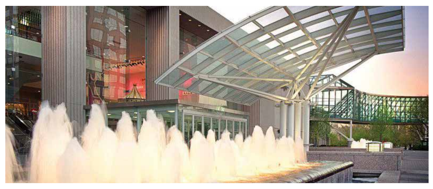
The three-level Crown Center features more than 50 shops and restaurants and offers something for everyone. It is connected to the Sheraton Kansas City Hotel at Crown Center by The Link, an elevated, climate-controlled pedestrian walkway.