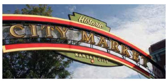
Since 1857 City Market has been a year-round food-related destination. It has received national acclaim and numerous awards for its eclectic mix of dining, shopping, and entertainment attractions in a unique open-air setting.

Union Station draws tourists from all over the world who marvel at the Grand Hall's 95-foot ceiling, three 3,500-pound chandeliers, and 6-foot-wide clock hanging in the central arch. Not far from the ASBH hotel, this elegant landmark is well worth a visit.